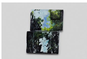
Malcolm Bradley Ivy (Backscatter) 2023 hydrographic print on foam 39 x 29 x 2cm £800 SMG-MABR-0003