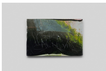
Malcolm Bradley Balcony (Backscatter) 2023 hydrographic print on foam 14 x 19 x 2cm £400 SMG-MABR-0004