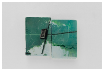
Malcolm Bradley A garden the camera can't see 2023 hydrographic print on foam, acetate 29 x 39 x 2cm £800 SMG-MABR-0001

Further works available to view on request: