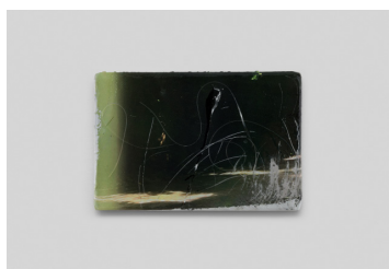
Malcolm Bradley Ivy hydrographic print on foam, acetate, 2023 14 x 19 x 2cm £400 SMG-MABR-0002

Further works available to view on request: