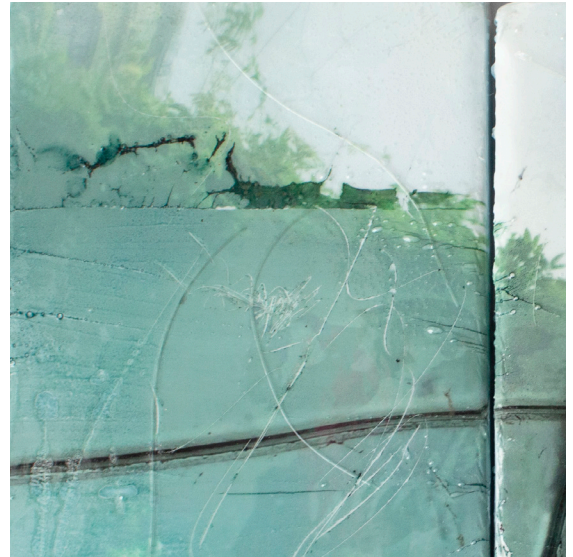
Image credit: Malcolm Bradley, artwork close up, 2023. Courtesy of the artist.

San Mei Gallery is pleased to present A garden the camera can't see by London-based artist Malcolm Bradley. This will be the third exhibition in San Mei Gallery's public-facing window space, presenting a series of emerging contemporary artists' micro-exhibitions with artworks for sale. Open 24 hours a day, this new programming strand facilitates responsive and exciting small-scale exhibitions in a hypervisible context.